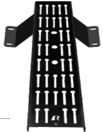
RAM-VC-LEG-101 (Leg Kit) shown attached to RAM-VC-TP-29 (Top Plate)