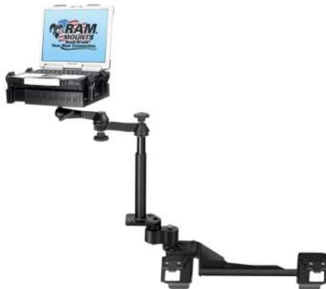
Complete Vehicle Mount RAM-VB-182-SW1

Low profile minimized intrusion into passenger leg space