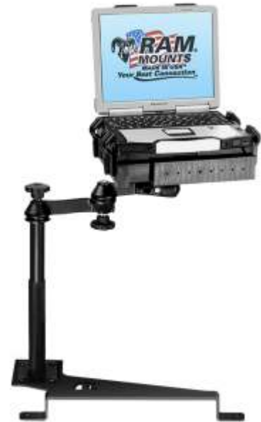
Complete Vehicle Mount RAM-VB-172-SW1

Installs in minutes with no drilling required. Lifetime warranty!