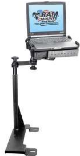
Complete Vehicle Mount RAM-VB-119-SW1

Supplied stabilizer is used to brace the base against passenger side seat for added rigidity. Lifetime warranty!