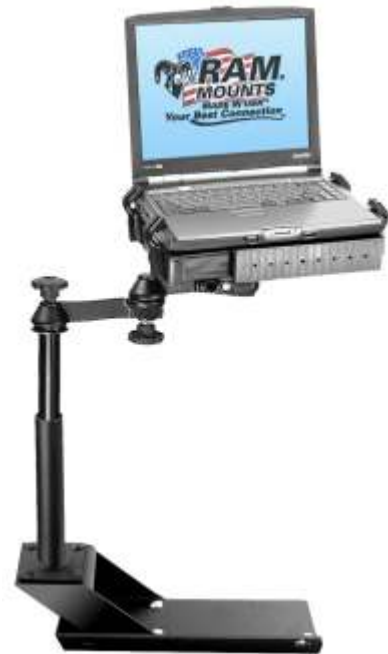
Complete Vehicle Mount RAM-VB-116-SW1