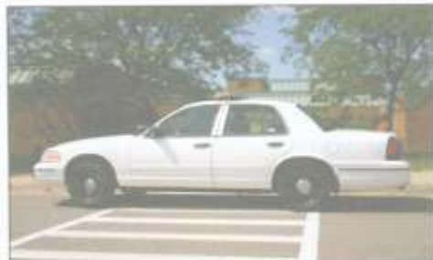
Police and Fleet Services

the package are expected in fall of 2007.