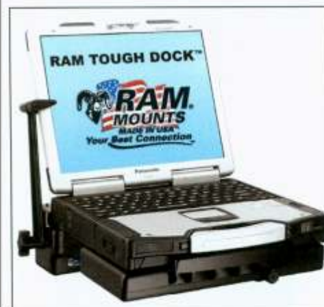
RAM Mounting Systems

The RAM Tough-Dock™ is available in both aluminum and high-strength plastic. This dock offers unmatched power capabilities, port replication, tamper-proof lock, integrated screen support and more. Simple to install and easy to use, the Tough-Dock features smooth lines, soft curves