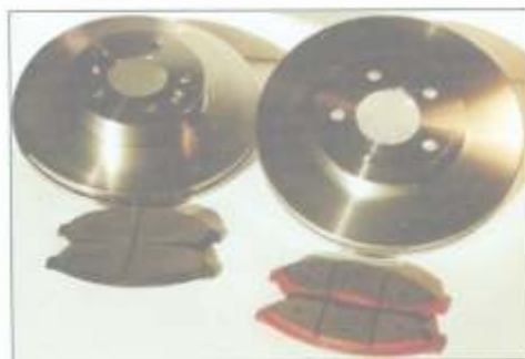
Precision Fleet Brakes

Precision Fleet Brakes' line of EMLS™ brand brakes is for governmental and commercial fleets. PFB's revolutionary new brakes excel in harsh driving environments. Having originally developed the technology for racing, PFB is now transferring its proven brake technology to fleets across the United States. Independent law enforcement agency testing confirms that, on average, EMLS pads and rotors outlast OEM brakes by two to four times. This reduces cost-per-