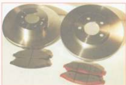
Precision Fleet Brakes

Precision Fleet Brakes' line of EMLS™ brand brakes is for governmental and commercial fleets. PFB's revolutionary new brakes excel in harsh driving environments. Having originally developed the technology for racing, PFB is now transferring its proven brake technology to fleets across the United States. Independent law enforcement agency testing confirms that, on average, EMLS pads and rotors outlast OEM brakes by two to four times. This reduces cost-per-mile and increases asset utilization (time on the road).