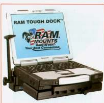
RAM Mounting Systems

The RAM Tough-Dock™ is available in both aluminum and high-strength plastic. This dock offers unmatched power capabilities, port replication, tamper-proof lock, inte-