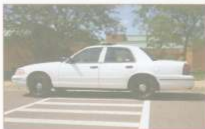
Police and Fleet Services

Police and Fleet Services through Police and Fleet Engineering, is developing an installation package that will be used to retrofit the current production Ford CVPIs to use E-85 fuel. E85 is a blend of 85% ethanol and 15% unleaded gasoline that is a high-octane, high-performance fuel made from renewable sources of energy. Fleet use of flex fuel vehicles is continuing to increase as a way of reducing operating costs and to meet the EPA Clean Air Standards. In many areas E-85 fuel is cost competitive with gasoline but is expected to gain an advantage as the oil prices continue to increase. Testing and certification of the package are expected in fall of 2007.